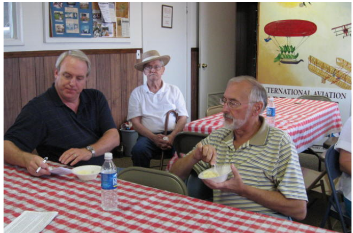
Ya know, if I had another bowl of that nice cold homemade ice cream, I think I could probably endure another trip outside.

After the meal, Chapter members gathered for a moments of the Chapters business. Topics included next months meeting at Sky Ranch airport in Knoxville. It was discussed that since the SPWC National Convention is scheduled to be held in Knoxville at the Knoxville Downtown Island airport (DKX), it would be a good time to look around a bit at the location and see what info we could gather for the Convention Organizing Committee. After further discussion, a motion was made to select that location for next years SE Regional. That idea seemed to go over big time. We'll discuss it further at next months meeting and make that motion at this year SE Regional in Salisbury, NC, October 19 – 21 at the Rowan Co. Airport (RUQ).