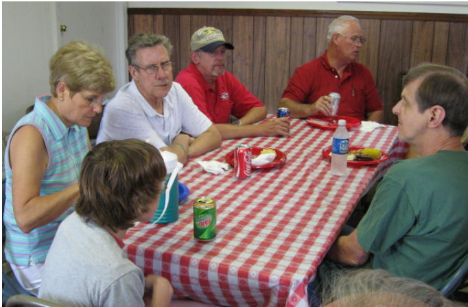
Tennessee Shortwingers cool off after a great meal at the annual Hotter 'n H... BBQ, contemplating a nap prior to the hotter 'n h... flight home