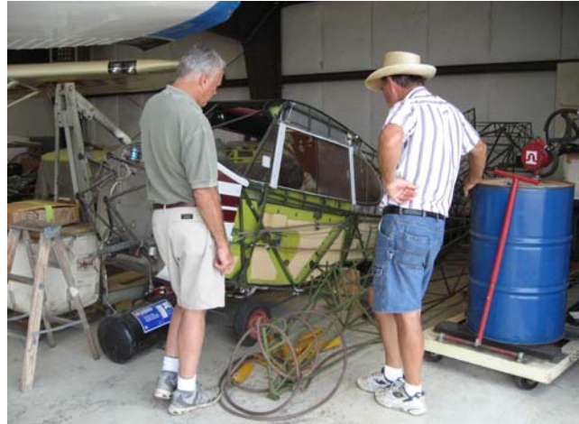
The next Fleeman work of art in the works...