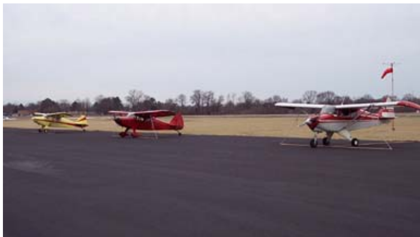
What we didn't have in quantity at DYR, we made up for in diversity

I departed Corinth MS in light rain although ceilings were 6000' or better. Climbing up to 4500' I enjoyed a healthy tailwind of 10-15 kts.