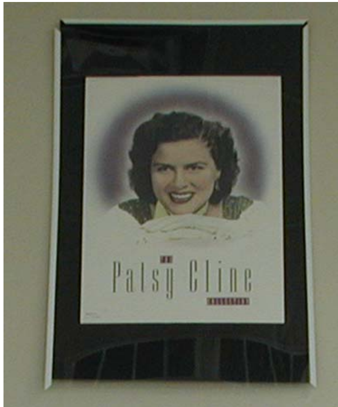
The namesake for Patsy's Sky Grille. The last stop before her date with destiny.