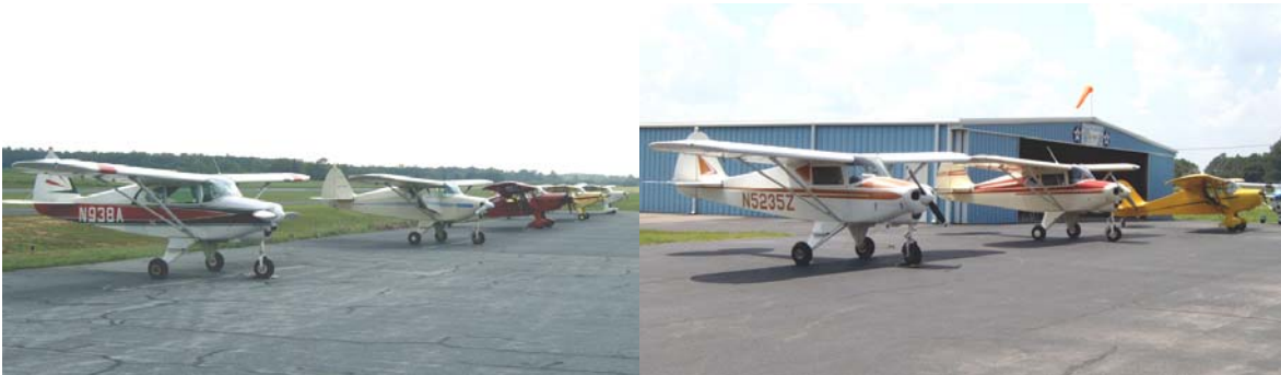
All Short Wings types present and accounted for at the fifth annual BBQ, from Vags to Tripacers