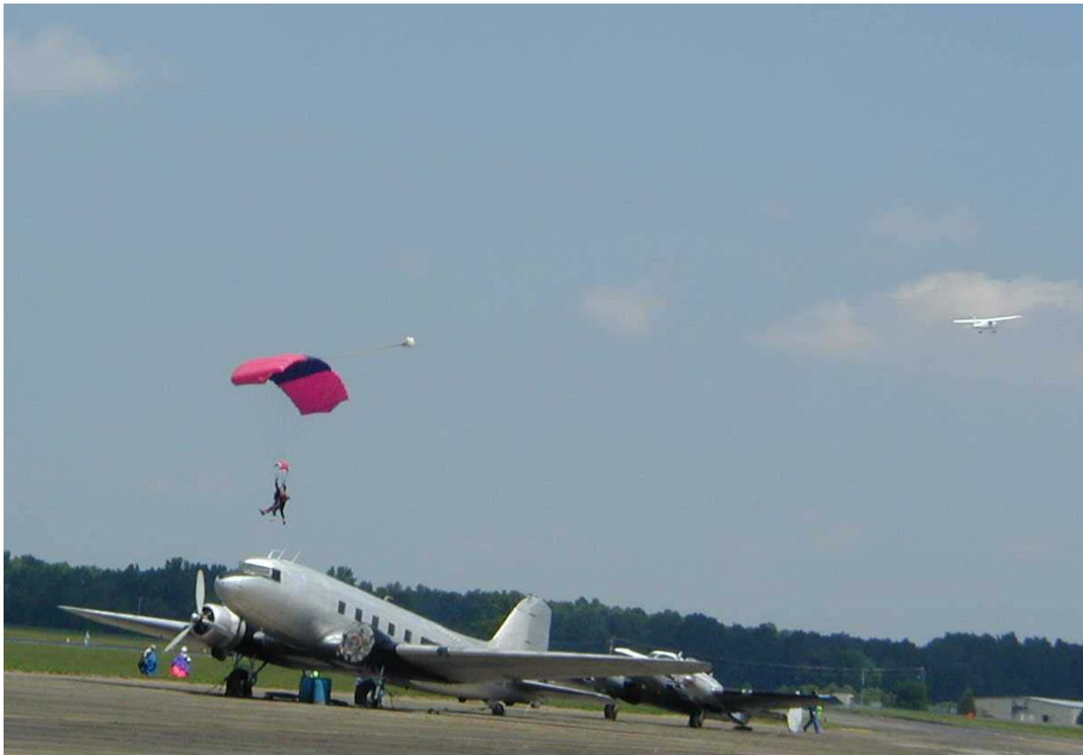
Parting Shot: "Dear, you might get me in a parachute, but I'm not going up in that Gooney Bird!" More from the Tullahoma.