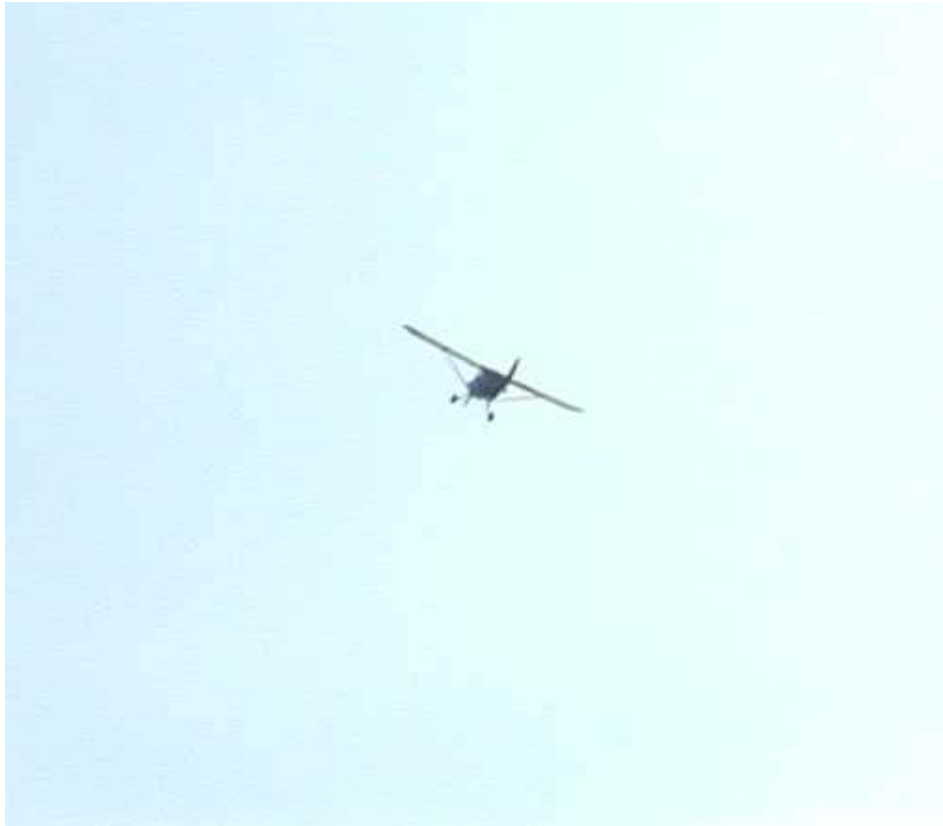
The Clipper heads for a hole in the clouds