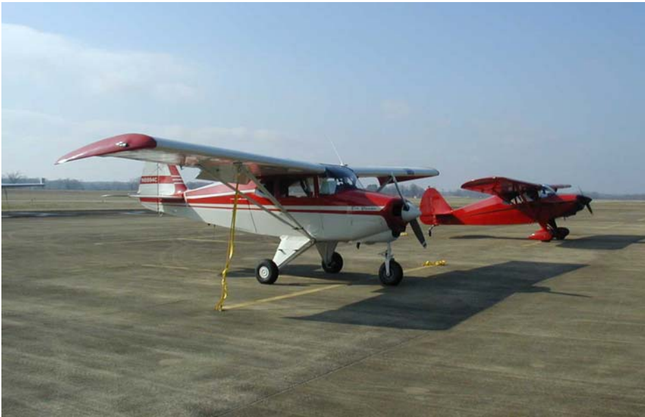
The Red Lady and 94 Charlie on the ramp at 3:00pm... Note the hint of blue and sharp shadows!

Next month, Saturday April 16 th , we shall meet at General Dewitt Spain Airport (M01) located right by the Mississippi River, north of downtown Memphis. It's within the Class B, 30 mile veil, so you need a transponder unless you're plane has no electrics, but you can fly in to M01 without entering the restricted Class B space if you stay below 1800' MSL. The Memphis Approach controllers