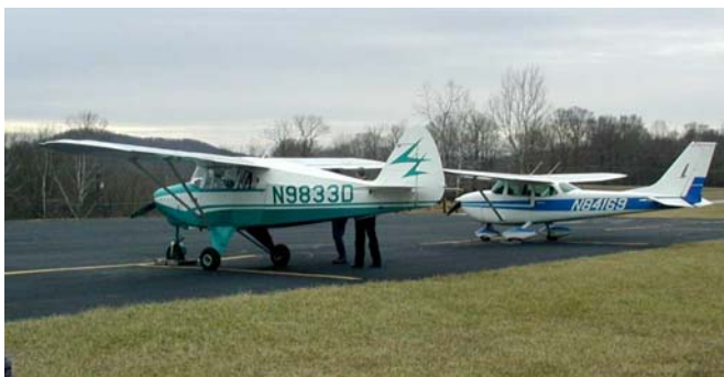
If ya want BLUE, find a Cessna! However, Tripacer's do come in other colors too...

As soon as I had some altitude after taking off, I contacted Louisville Flight Service to activate my flight plan and get a weather update. AIRMET for icing below 9000' and PIREPS for ice pellet precipitation along my route of flight sounded somewhat ominous. Reported ceilings and visibilities remained 7000' and 8 miles or better, so I pressed on, keeping an eye on the outside temperature. At 3000' initially I stayed just below the freezing level but as I proceeded southwards the temperature steadily rose. Throughout the 2-hour trip all I encountered was intermittent light rain.