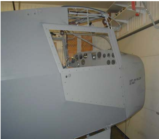
New Door Skins