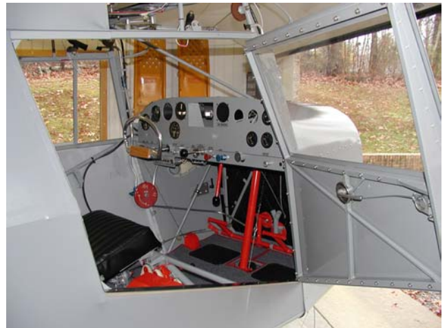
New Panel. Check out the "polished" control yoke.