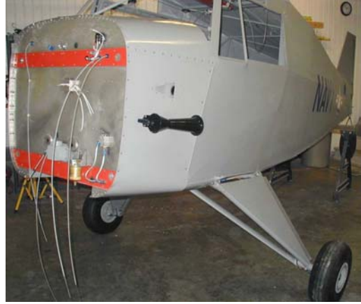
So this is how Milkstools become taildraggers. Wow! Look at that firewall!