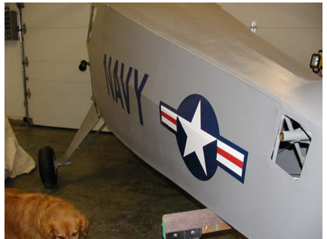
Jim's Colt project is sure looking good. Can't wait to see those wings!