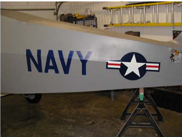
Prepping up for carrier landings